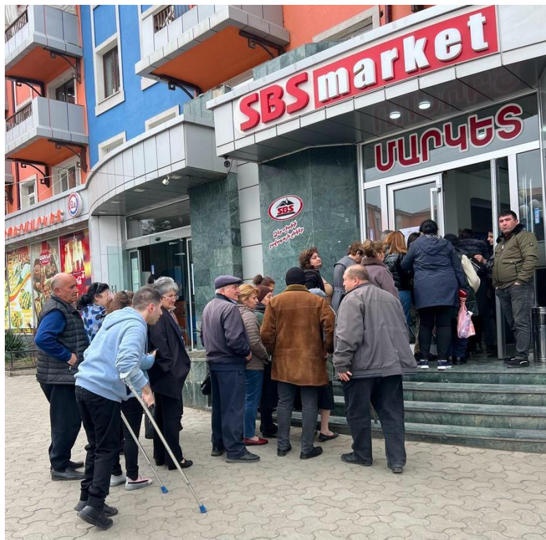
Image 18. A person with disabilities queueing in front of a shop