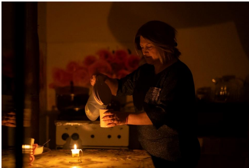
Image 9: People are forced to use candles as the rolling blackouts continue