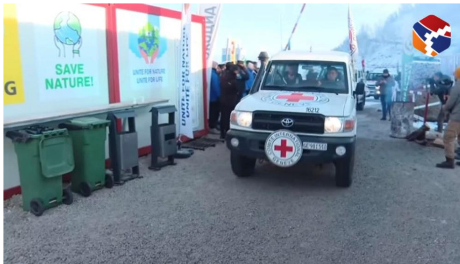
Image 1: The ICRC vehicle passes through the blocked section of the road