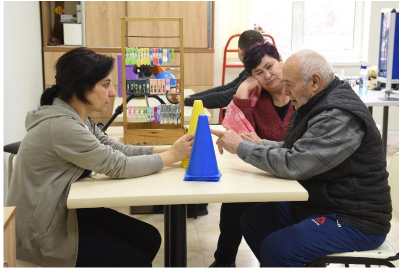
Image 20: Isolation and psychological problems severely effect the mental state of the elderly