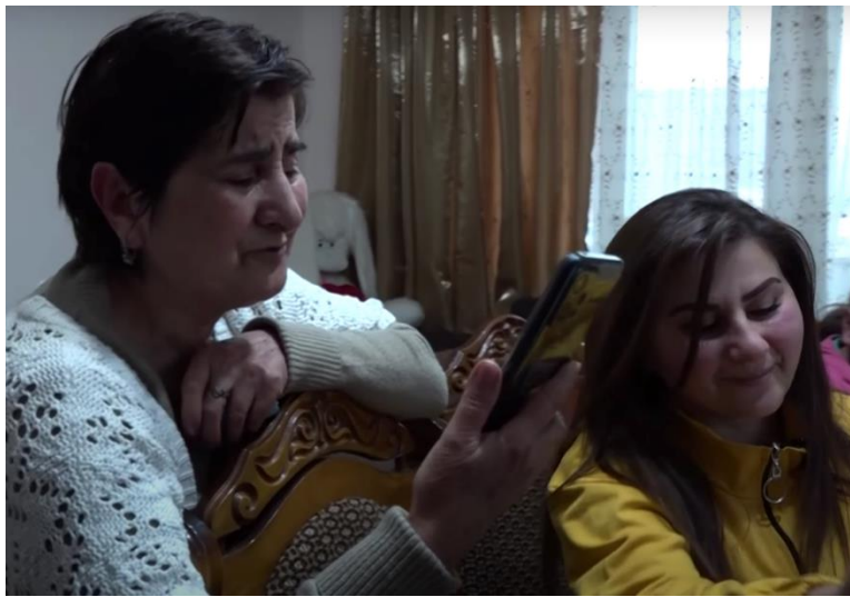
Image 12: Separated from her children a mother cries as she is uncertain when she will be reunited with her loved ones again

50. Around 550 children have been deprived of the opportunity to return to their family and homes as a result of the blockade, 60 of them have been left without parental care, while the rest – with one of the parents. Only on the 39 th day of the blockade, with the support of the ICRC and Russian peacekeepers, it was possible to return children that were left without parental care to their families, as well as a group of children together with their parents. Many children are still left stranded away from home, hoping to return back together with their parents or with one of them.