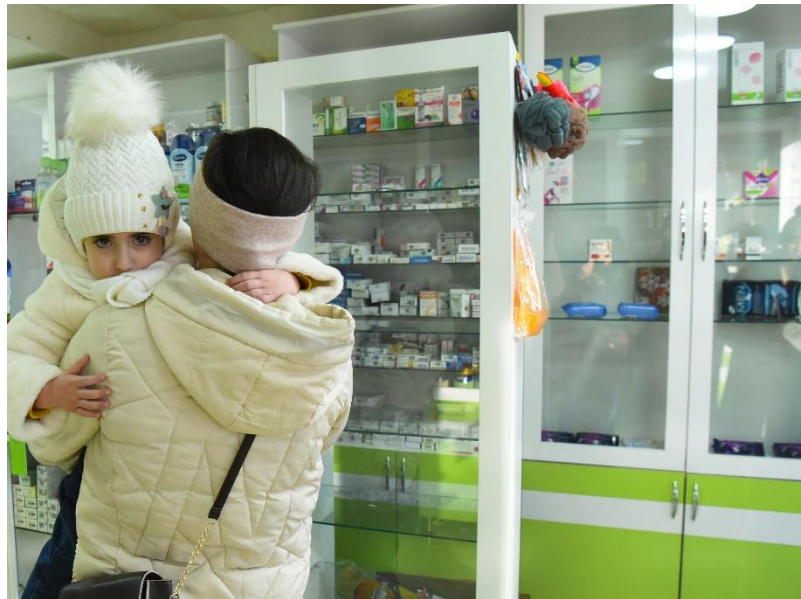
Image 3: A mother in Artsakh looking for medication in an empty pharmacy for her sick child