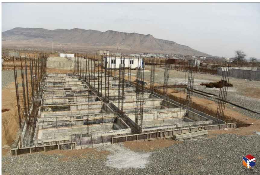
Image 22: The construction of the apartments for the displaced people are suspended