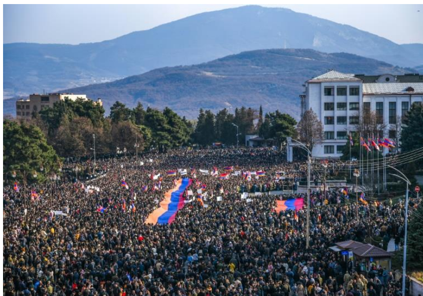
Image 24: Rally of thousands of people in Stepanakert for the right to self-determination and against the discriminatory policy of Azerbaijan

104. All Azerbaijani violations against the people of Artsakh are deeply directed against their right to self-determination and the fact of its realisation, in order to finally resolve the conflict to their advantage through ethnic cleansing based on the “no people, no rights” logic.