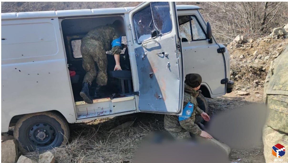
Image 23: The sight of the terrorist attack of the Azerbaijani Ambush against the Artsakh policemen on duty on March 5 2023

103. Furthermore, on March 5, 2023, the Azerbaijani side resorted to a new terrorist act, in particular, an ambush group of the Azerbaijani armed forces crossed the line of contact and attacked the car of the Police of the Republic of Artsakh in civilian duty, driving from Stepanakert along a road about 1km away from the contact line. As a result of the attack, Artsakh three policemen were killed and another one was wounded. This attack and other violations of the ceasefire regime aim at making physical and psychological terror against the Artsakh people under blockade, which is also a clear manifestation of the Azerbaijani state policy of racial discrimination against Armenians. 6