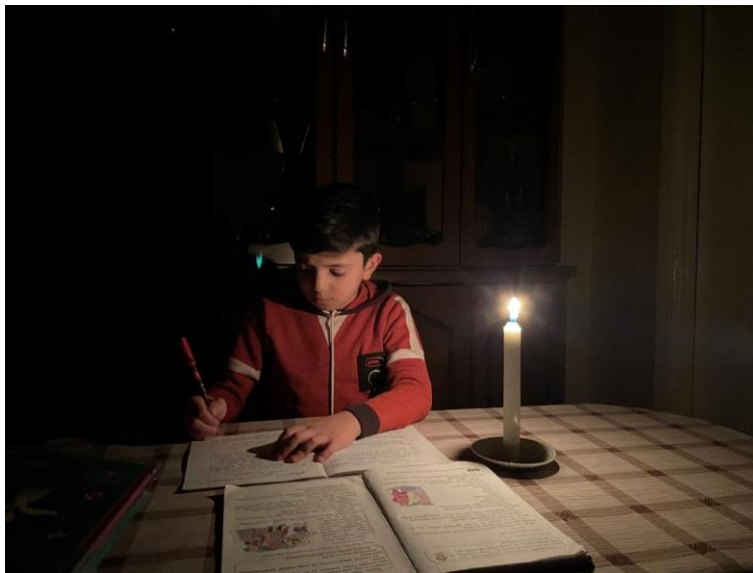
Image 15: A 8-year-old boy forced to complete school work by candlelight due to rolling blackouts