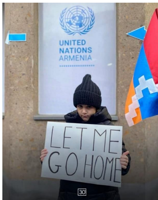
Image 13: A child separated from his family from Artsakh in front of the UN office in Yerevan

50. Around 550 children have been deprived of the opportunity to return to their family and homes as a result of the blockade, 60 of them have been left without parental care, while the rest – with one of the parents. Only on the 39 th day of the blockade, with the support of the ICRC and Russian peacekeepers, it was possible to return children that were left without parental care to their families, as well as a group of children together with their parents. Many children are still left stranded away from home, hoping to return back together with their parents or with one of them.