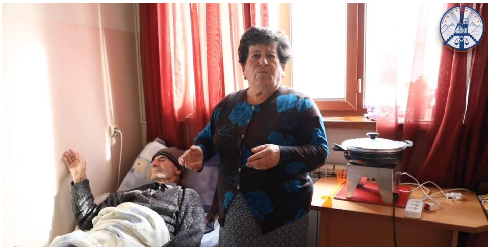
Image 19: As a result of the blockade, the older persons face various problems