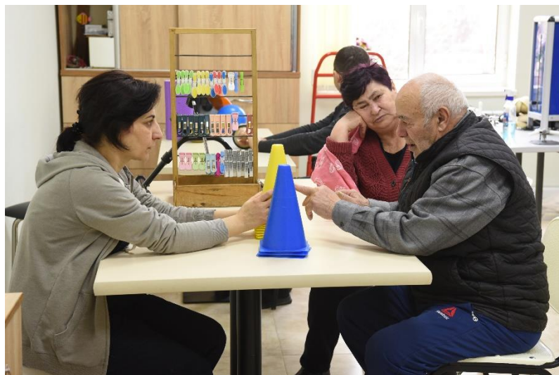
Image 20: Isolation and psychological problems severely effect the mental state of the elderly