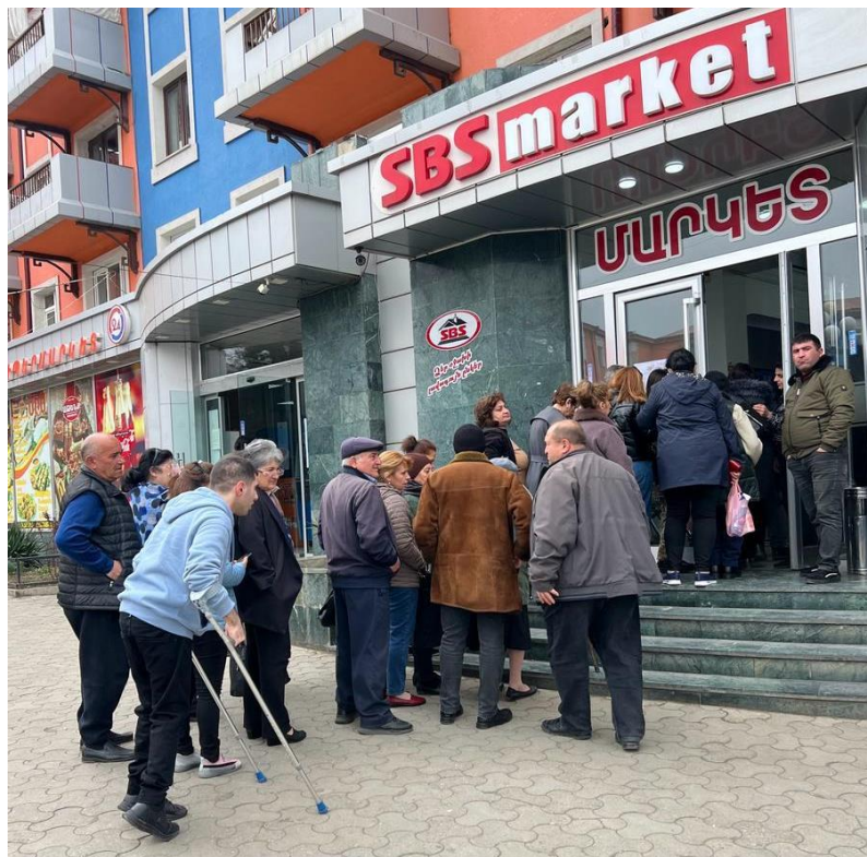
Image 18. A person with disabilities queuing in front of a shop