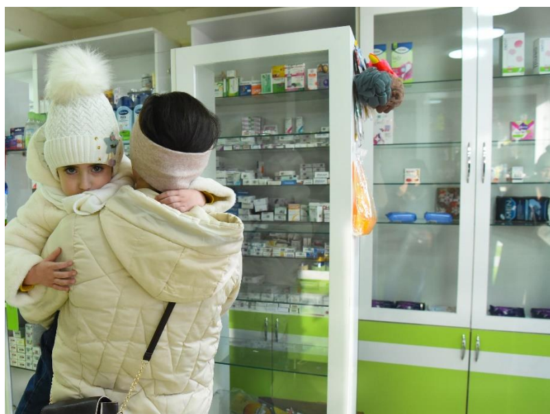
Image 3: A mother in Artsakh looking for medication in an empty pharmacy for her sick child