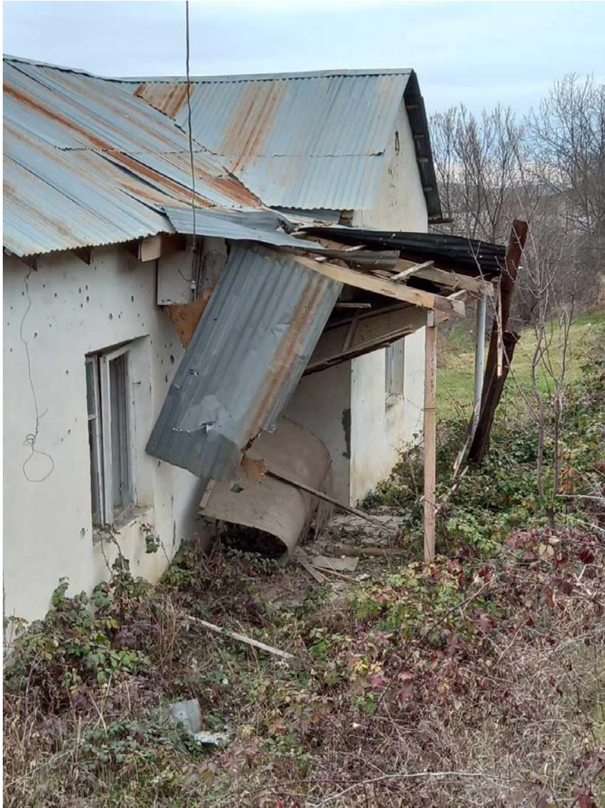
Image 2 . Damaged community building in Parukh village

March 11, 2022 - 7 projectiles exploded in the direction of Parukh village of Askeran region between 12:00-19:00.