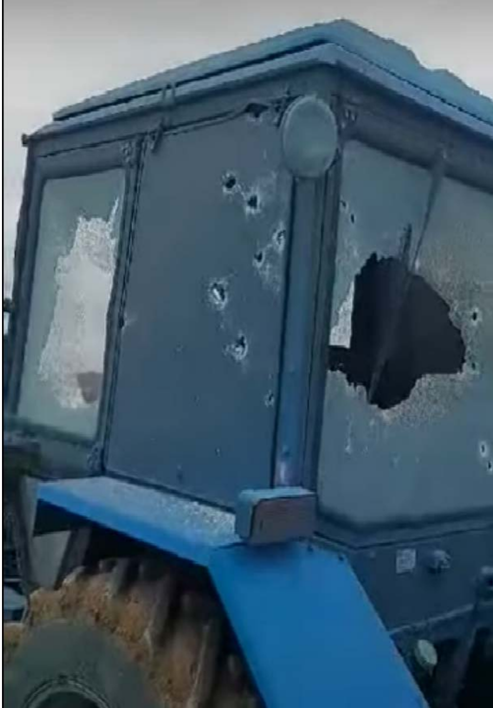
Image 3 . Damaged tractor in Nakhichejanik village