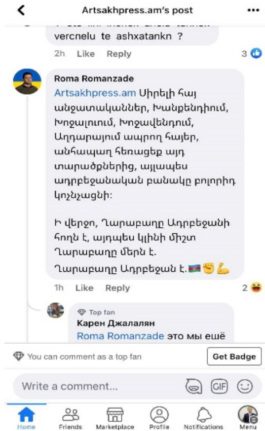
Image 8. Azerbaijani user comment

Posts and comments with the same content are also spread by Azerbaijani Facebook users. Image 8 shows the comment of an Azeri user, urging Armenians to leave immediately, otherwise the Azerbaijani army will destroy everyone.