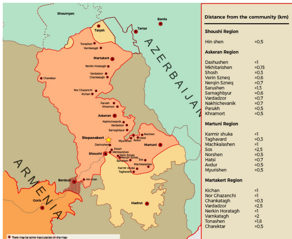
Image 1. Border communities of Artsakh after 44-day war

The propaganda, military, psychological and economic threats and terrorist acts of the Azerbaijani side intensified in February-March 2022. If in the past, the Azerbaijani Armed Forces fired mainly with small-caliber firearms, since March 7, 2022, high-caliber weapons has been used. From March 7 to March 12, 2022 the Azerbaijani side used a 60 mm grenade launchers in different parts of Artsakh, firing a total of 57 projectiles. At the same time, the ceasefire continued to be violated by firearms, targeting homes and civilian infrastructure.