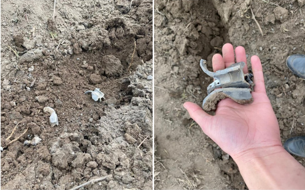
Image 4 . Ammunition remains in a vineyard in Khamort community