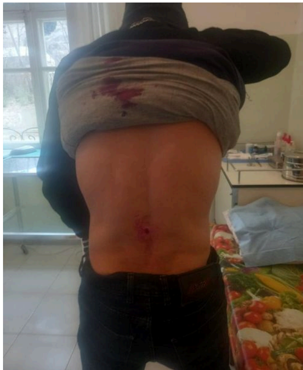
Image 5 . Injured civilian in Khamort