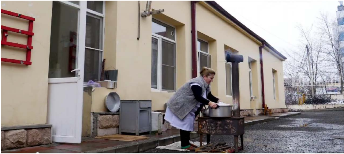
Image 6. The process of food preparation in one of the kindergartens of Stepanakert

process of organizing and delivering children's food in kindergartens. The staff has to use wood and electric stoves installed outside for cooking 6 .