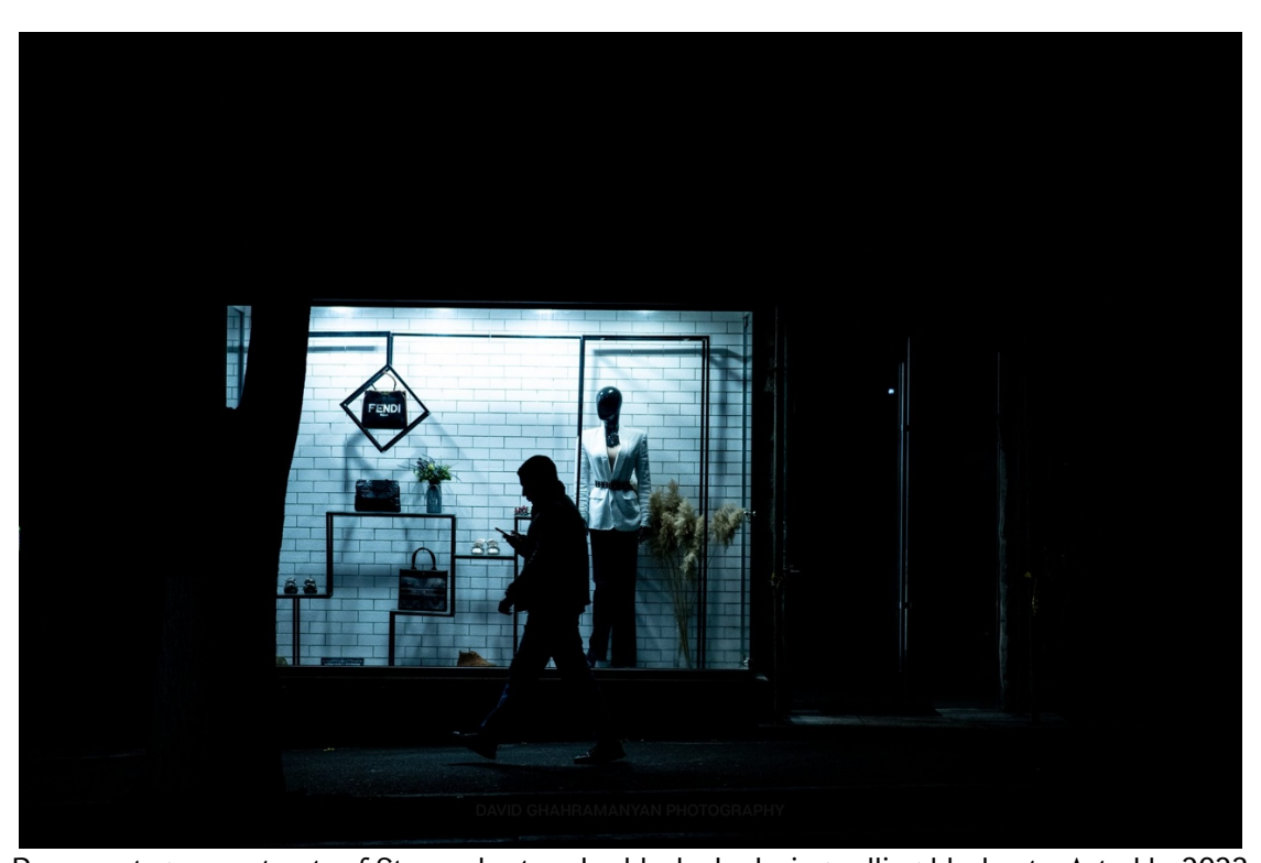
Power outages on streets of Stepanakert under blockade during rolling blackouts. Artsakh, 2023

As Artsakh produces only 57% of its electricity consumption, a 4-hour rolling blackouts schedule was introduced by the Artsakh government for several days to manage the electricity crisis in Artsakh. The Azerbaijani authorities are still not allowing repair works by Artsakh specialists on the main electricity line of Artsakh, damaged since January 9, 2023. Accordingly, and as of January 21, 2023, a 6-hour rolling blackouts schedule has been implemented. Notably, the local production of electricity is carried out mostly through the Sarsang Hydro-Power Plant, where water in the Sarsang reservoir is used in large volumes to generate electricity. Continuing use of the reservoir in these volumes will deplete capacity quickly, and longer rolling blackouts will need to be imposed.