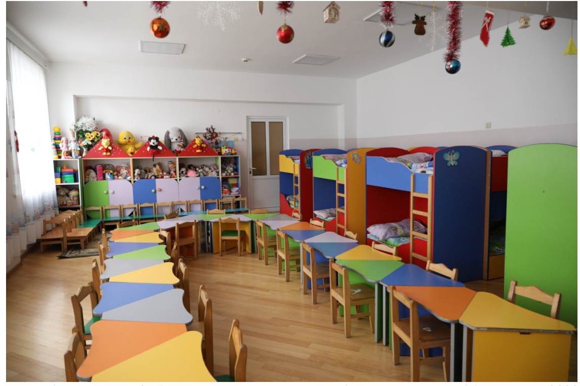
Empty Kindergarten Nº2 of Stepanakert under blockade without gas and electricity. Artsakh, 2023

90% of other educational institutions, such as secondary vocational schools, art schools, medical and music colleges, and youth creative centres, are also heated by gas. Due to the absence of gas supply, these also had to completely cease their activities.