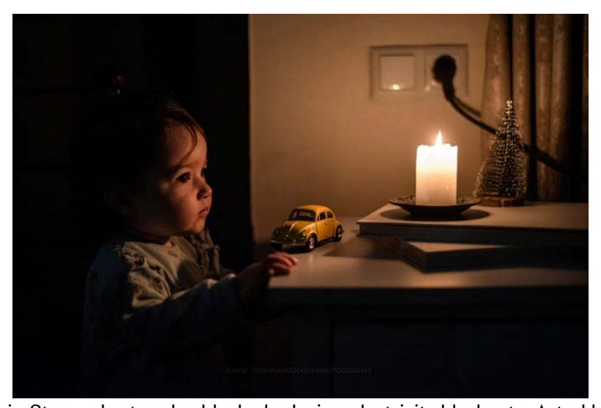
A child in Stepanakert under blockade during electricity blackouts. Artsakh, 2023

In the current situation, it is impossible to operate education effectively in Artsakh. 65% of the schools in the country are heated by gas only; importantly, 60% of the total number of Artsakh students receive education in such gas-heated schools. Due to the impossibility of providing proper heating, the Artsakh Government was obliged to suspend the school classes until further notice.