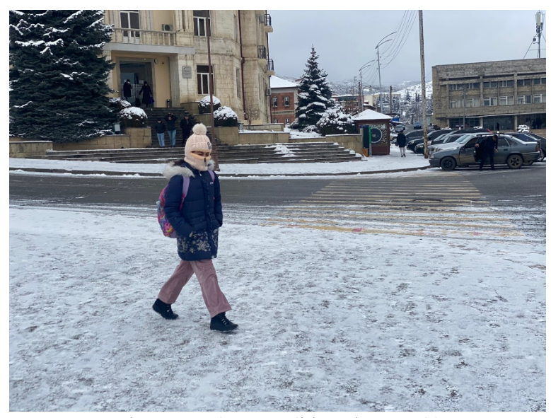
Winter weather conditions in Artsakh

Gas is also used in Artsakh households to prepare food; therefore, its absence directly affects the normal organisation of nutrition of the population. The danger is compounded here, where both gas <u>and</u> electricity are not being supplied to Artsakh: people are deprived of vital necessities—heating for physical warm and heat and hot water for cooking food—with absolutely no alternative source of energy. In this precarious confluence of the deprivation of essential resources, the humanitarian urgency is compounded geometrically.